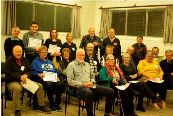
The Class of '22

Lessons are finished for the year and we have 25 new members raring to go. On Monday 18 July we handed out certificates to 18 alumni in a graduation ceremony. We had a good turnout of members wanting to welcome the new cohort. The graduation was a party with finger food and wine. We even had a cake.