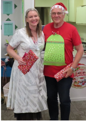
The winning costumes

We had our Christmas Party on Saturday 10 December. It was nominally fancy dress with a Christmas Bells theme. There was a prize for the best costume.