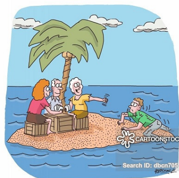
"OH, THANK HEAVENS!! A FOURTH!"

To play properly you should have two packs of cards. Before you start you cut for partners. The two highest play together with the highest card dealing. Dealer's partner should shuffle the other pack during the deal. When finished the shuffler places the cards to the right. (This is the left side of the next dealer.) Dealer starts the bidding and play continues normally. Once the hand is finished and scored. The player on Dealer's left in the new dealer. The new Dealer picks up the cards which should be on waiting on the left and passes them to the previous dealer to cut.